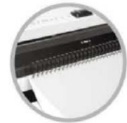
Special device for wire hanging