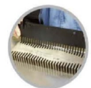
The unique design of single cutting plate