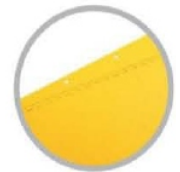
Dual punching system both for 21 holes & 3 or 4 holes