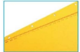
Double blades for 21 and 4 holes punch