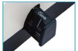
Adjustable punch depth.