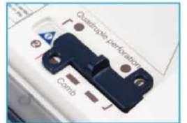
2 in 1 paper slot punching by easy switch.