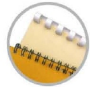
Comb + wire punch & bind and wire closing, low cost, high quality & efficiency