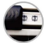
Micro-adjustor for exact closing of wire