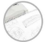
Available for oversized comb binding