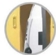
Unique designed appearance can standing upright to put preserving and easy carry.