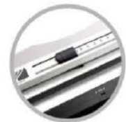
User-friendly edge guide for easy paper format adjusting.