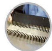
The unique design of single cutting plate