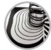
Measure guide to determine the size of wire correctly.