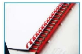
Bind capacity up to 19mm wire and 51mm comb.