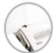
Up to 42 holes punch & bind