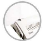
Up to 42 holes punch & bind